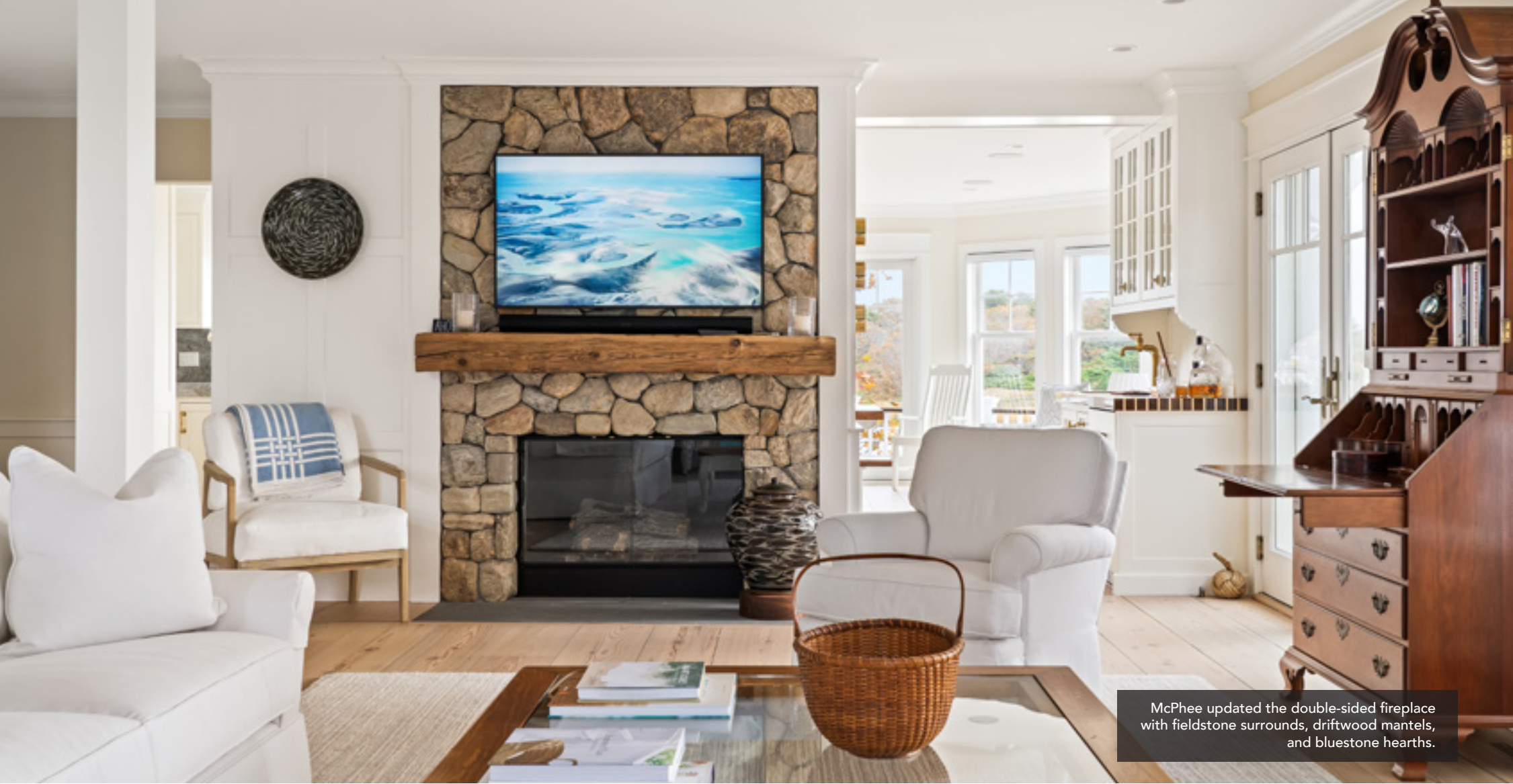
McPhee updated the double-sided fireplace with fieldstone surrounds, driftwood mantels, and bluestone hearths.

Just off the kitchen is a dining table centered on a double-sided fireplace. McPhee upgraded the fireplace's existing brick with New England fieldstone and reclaimed beam mantels. Now, both the dining area and living room enjoy the warmth of a wood fire in cooler weather. Rounding out the main living area is a new built-in bar with fridge, sink, and storage for glasses and stemware. On the opposite wall, a niche with glass shelves stores liquor within easy reach.