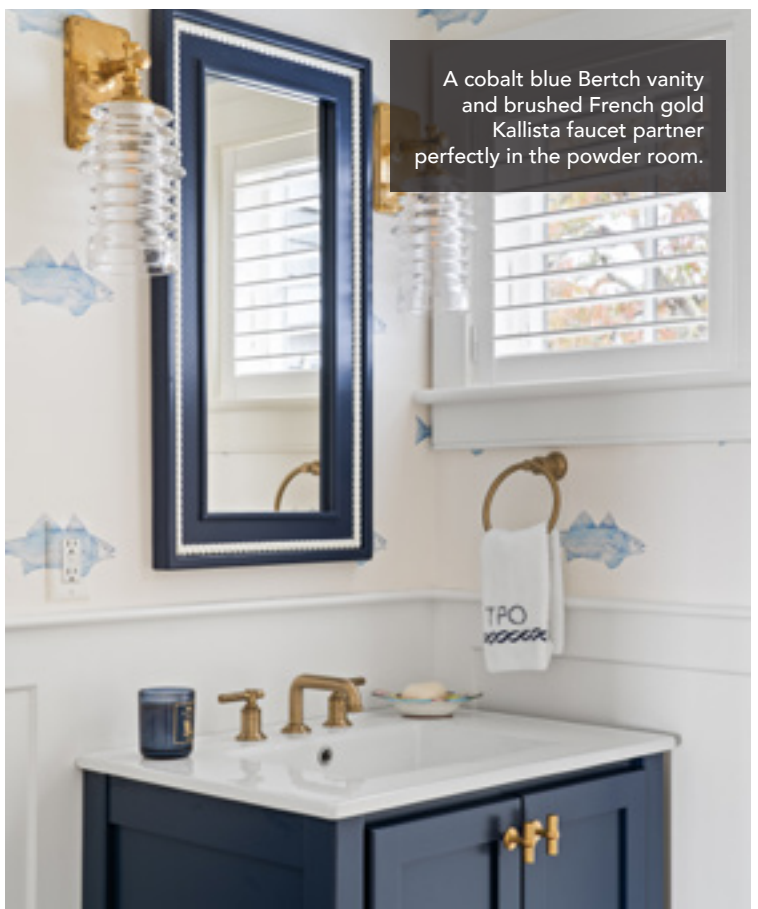
A cobalt blue Bertch vanity and brushed French gold Kallista faucet partner perfectly in the powder room.