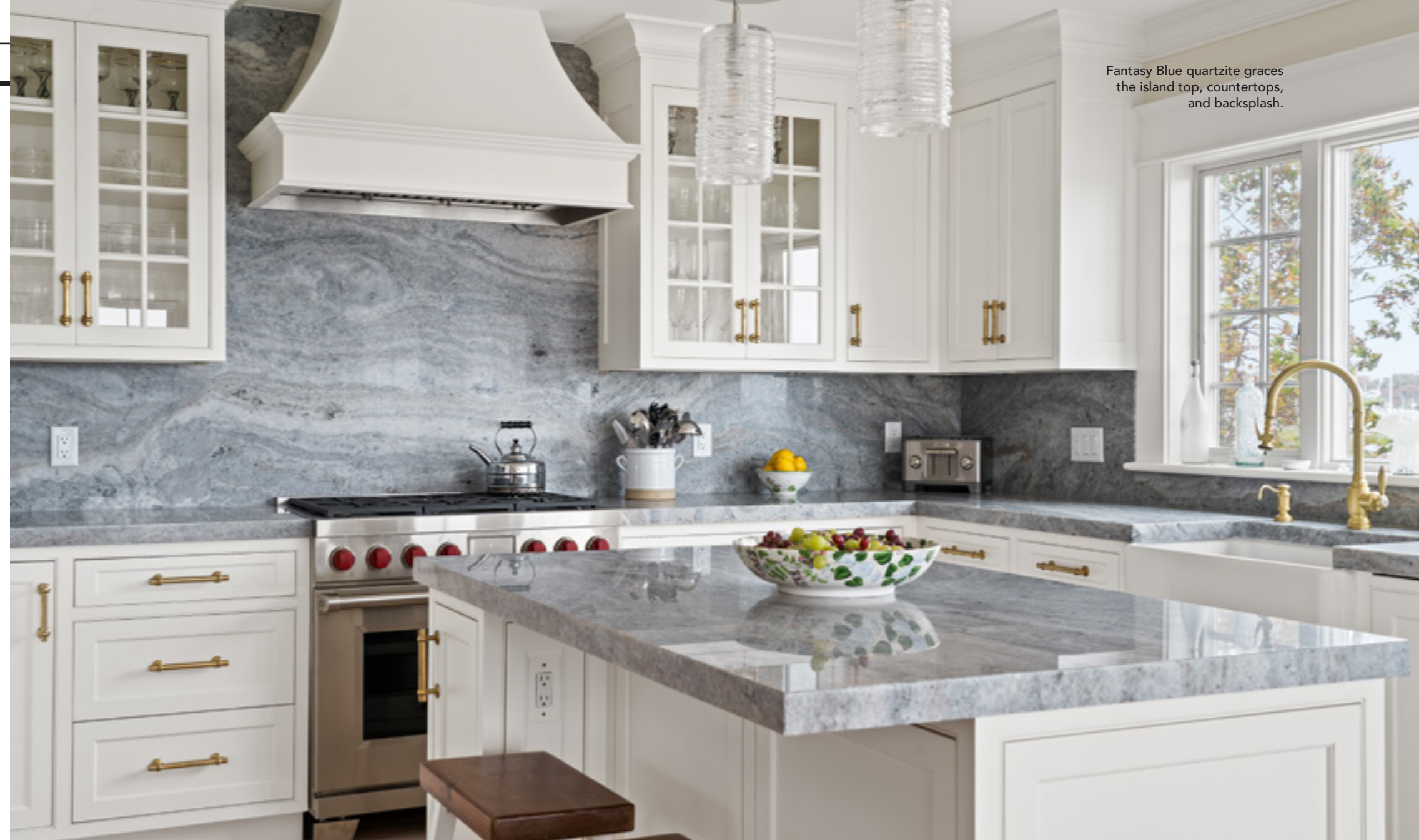
Fantasy Blue quartzite graces the island top, countertops, and backsplash.

The eight-month renovation delivered a variety of wish-list items for the new owners, including an updated primary suite with a bar for morning coffee and some cosmetic bathroom updates. It also created a much-improved kitchen space, complete with white Shaker-style cabinets by Plymouth Rock Kitchens. Thick quartzite countertops extend up into the backsplash—its veining mimics the swirl of sea water, an homage to the setting.