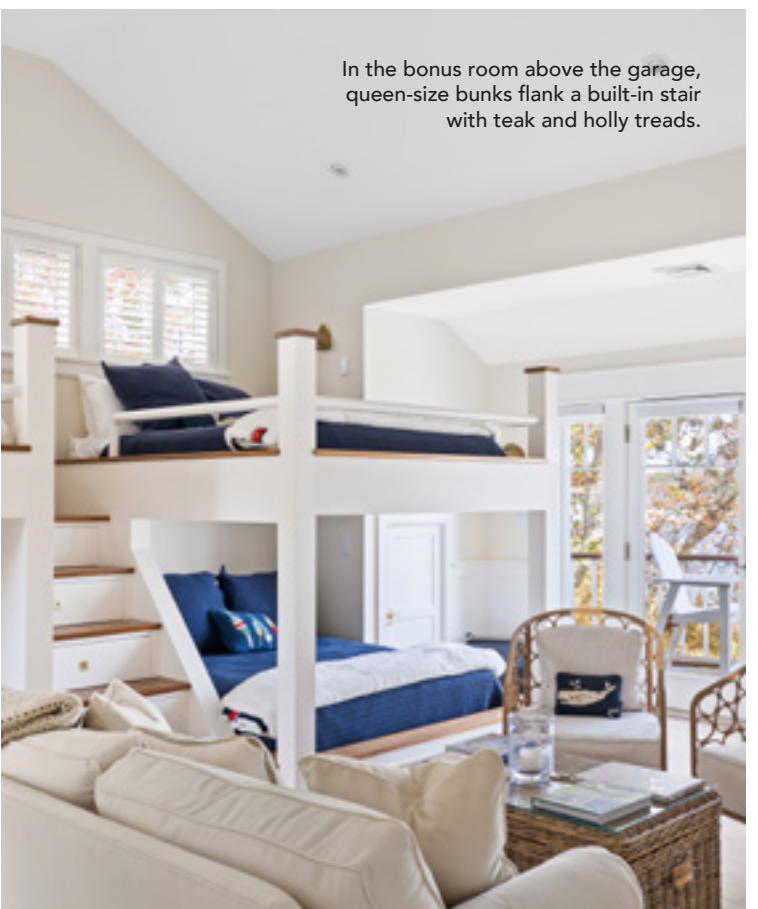
In the bonus room above the garage, queen-size bunks flank a built-in stair with teak and holly treads.