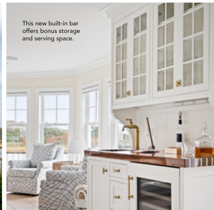
This new built-in bar offers bonus storage and serving space.