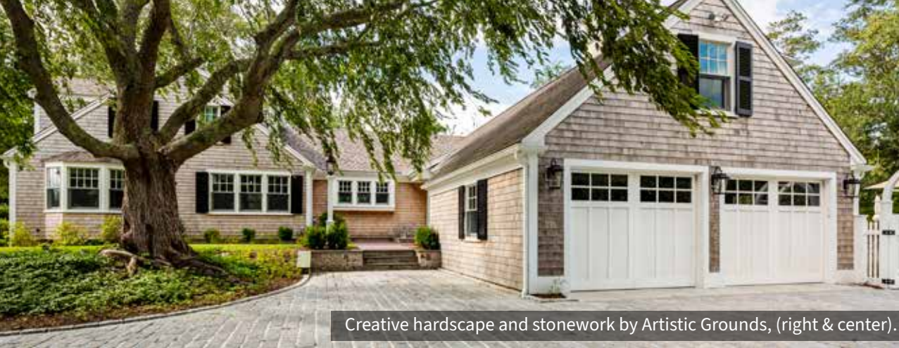
Creative hardscape and stonework by Artistic Grounds, (right & center).