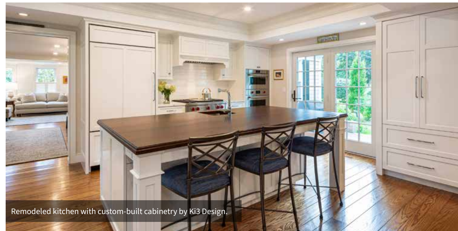
Remodeled kitchen with custom-built cabinetry by Ki3 Design.

Kendra designed the kitchen layout, which included a five-foot bump-out (the only change in the home's footprint other than a cozy indoor/outdoor porch off the family room). The couple went with Ki3 Design of Natick for custom-built Shaker-style cabinetry. "They had designed our kitchen in Dover and did a fabulous job," Arkle says.