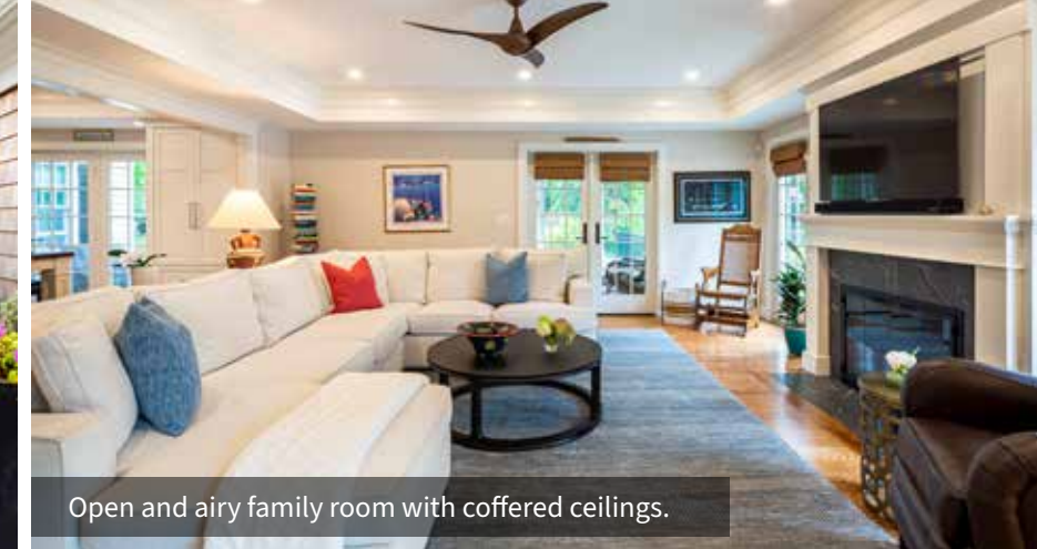
Open and airy family room with coffered ceilings.

driveway, the design and execution of the hardscaping—that’s all his.”