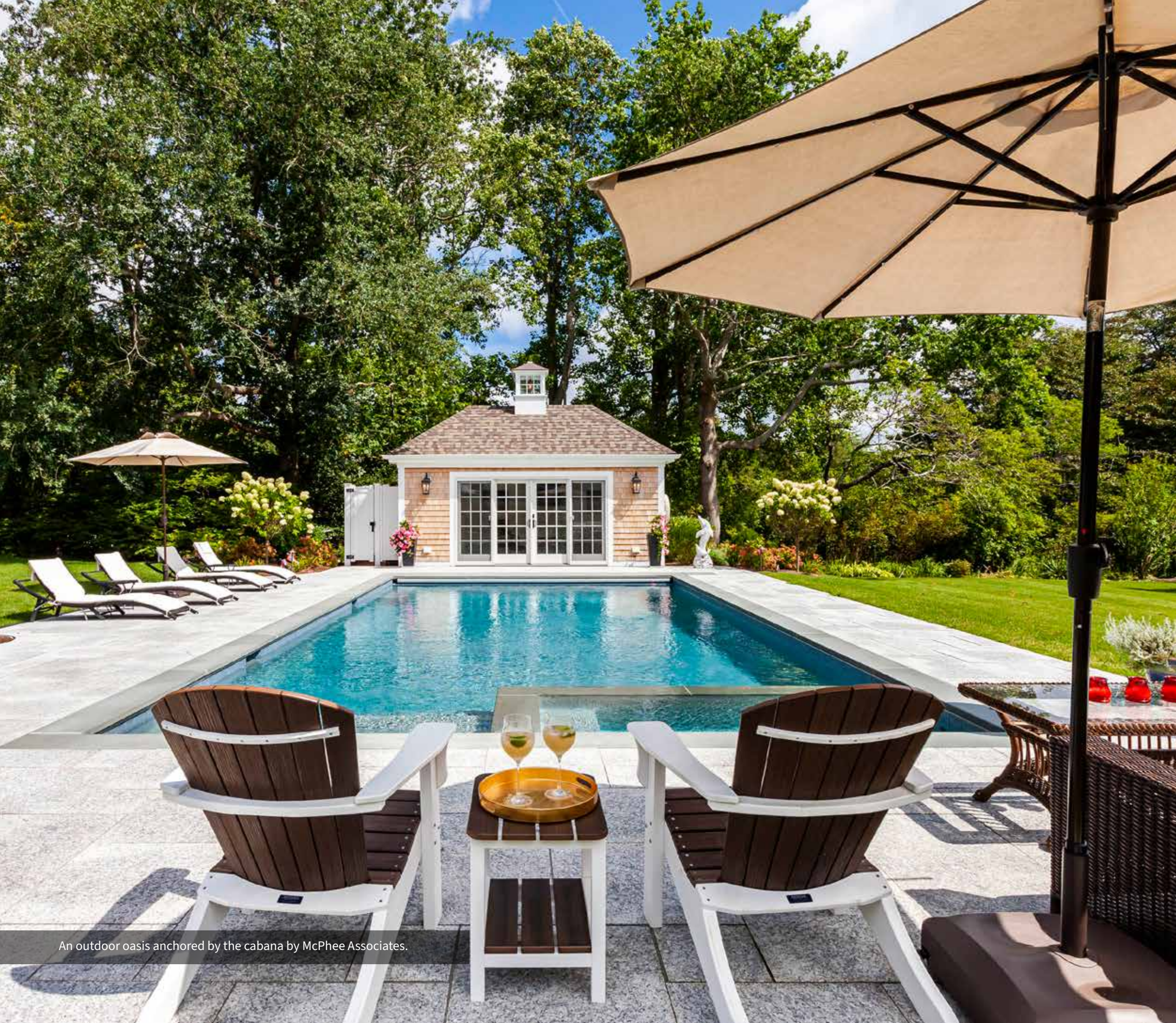
An outdoor oasis anchored by the cabana by McPhee Associates.

To offset the white of the cabinets, Arkle chose a Sapele mahogany top for the island, which cleans up easily with vinegar and water.