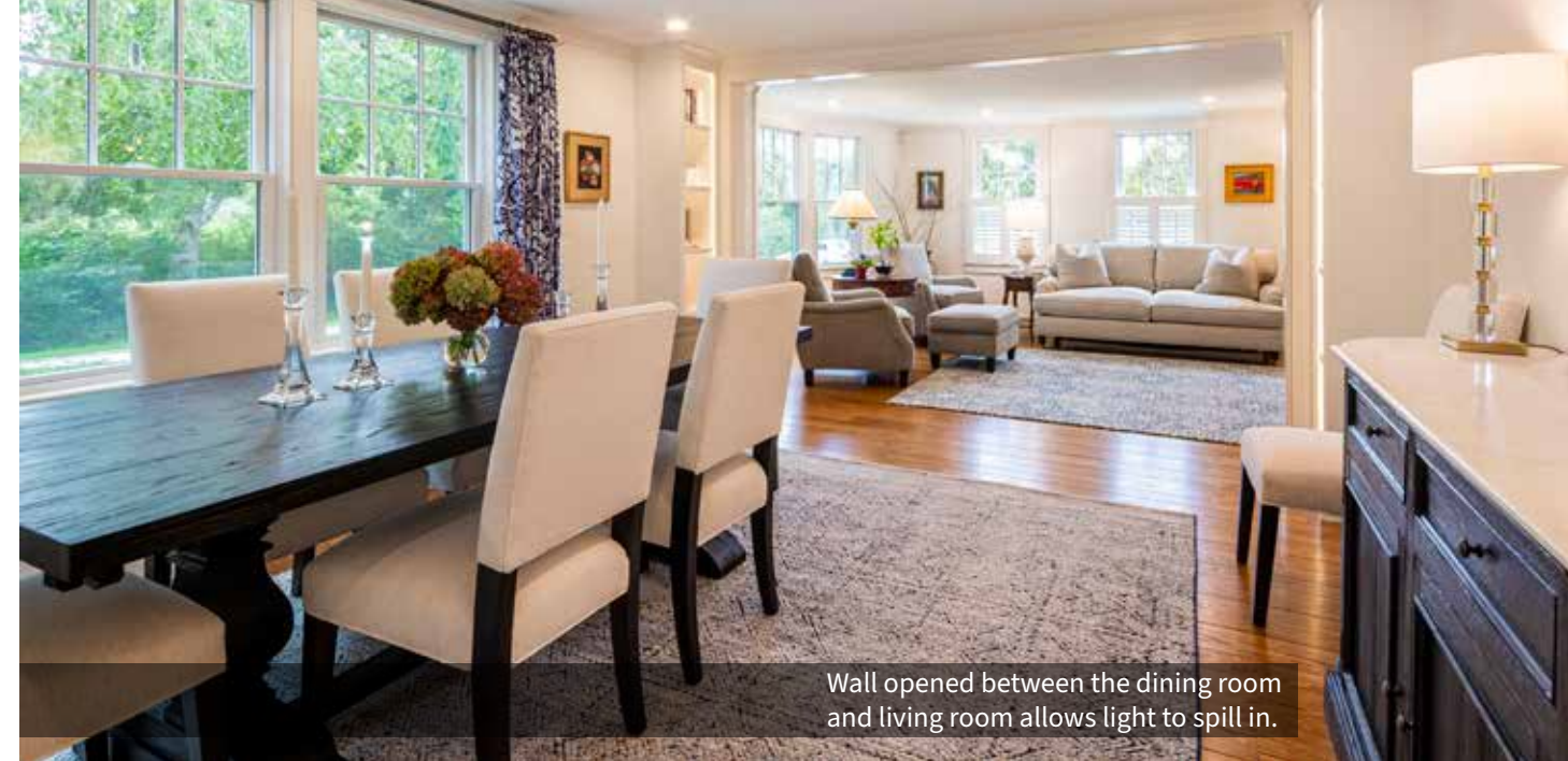
Wall opened between the dining room and living room allows light to spill in.

There had also been a wall with a door between the dining room and the kitchen. They couldn't remove all of it because the kitchen needed that wall space for appliances. But they were able to widen the doorway from the standard 30 inches to 42 inches and create a pocket door that could slide into the wall. Says McPhee project manager Wyman Brooks, "We cheated by pushing the wall into the dining room a few inches. We couldn't have created the pocket for the door otherwise, with plumbing and other obstacles. Now, the wider opening makes a nice pass-through."