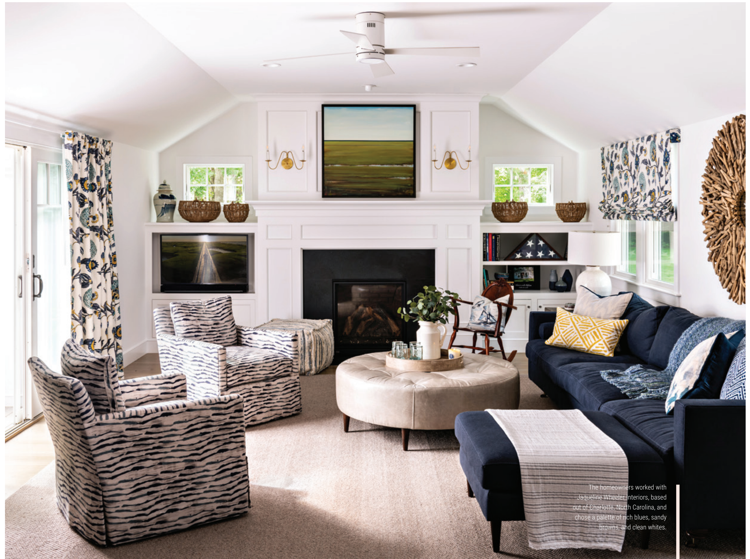
The homeowners worked with Jaqueline Wheeler Interiors, based out of Charlotte, North Carolina, and chose a palette of rich blues, sandy browns, and clean whites.

When her parents passed away, the homeowner bought the ranch from her siblings (one found a house a few streets over). She was looking forward to upholding family traditions, but it was also time for some careful updates. "We wanted to honor my folks and the house and also, bring it into the 21st century with a newer kitchen and an easier flow," says the homeowner.