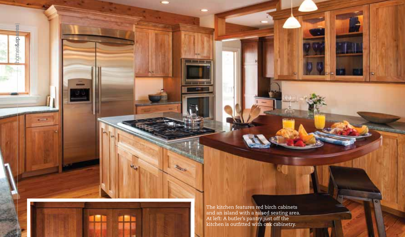
The kitchen features red birch cabinets and an island with a raised seating area. At left: A butler's pantry just off the kitchen is outfitted with oak cabinetry.