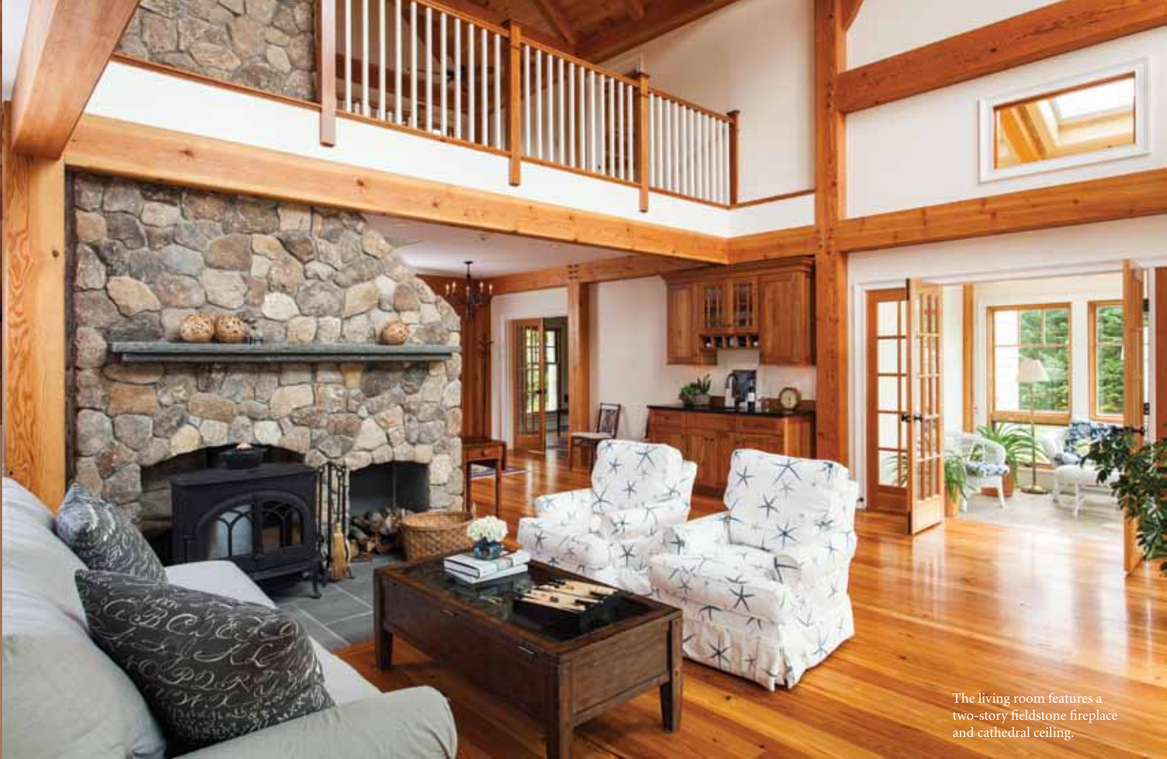
The living room features a two-story fieldstone fireplace and cathedral ceiling.