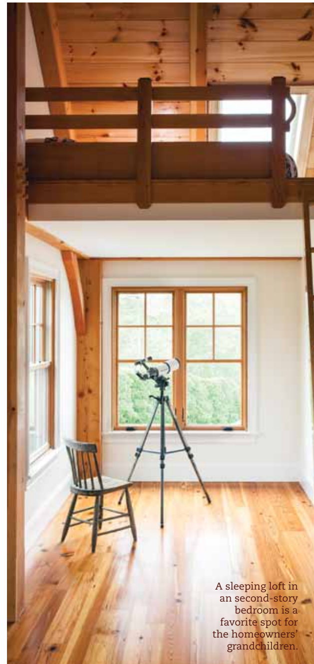
A sleeping loft in an second-story bedroom is a favorite spot for the homeowners' grandchildren.