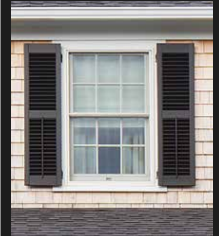
Traditional wood-louver shutters and hardware were purchased from New England Shutter Mills in Lawrence, Mass.