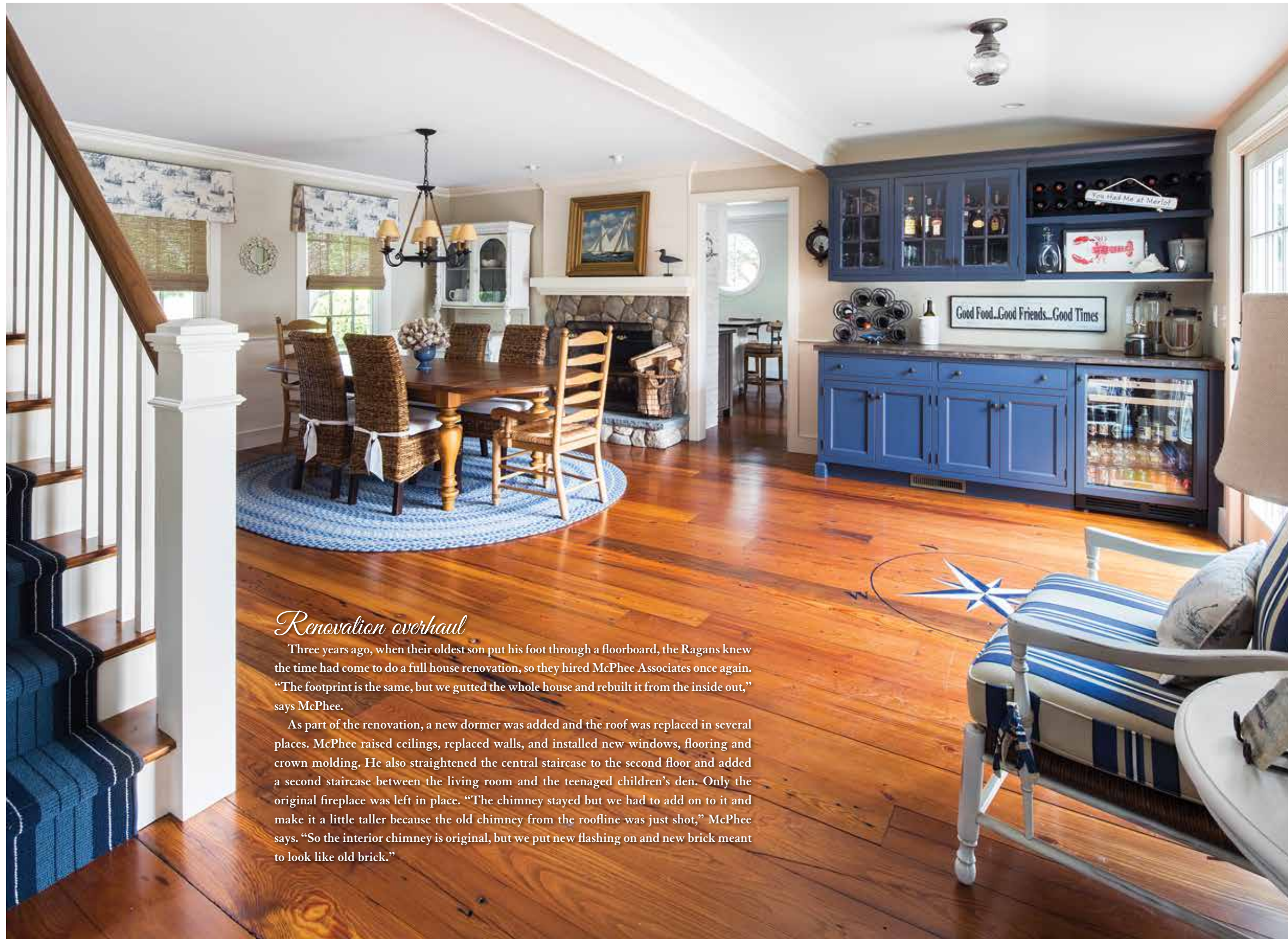
Left: Reclaimed antique pine flooring is one of the owner's favorite features in the newly remodeled home, seen here with a classic compass rose painted at the foot of the bar.