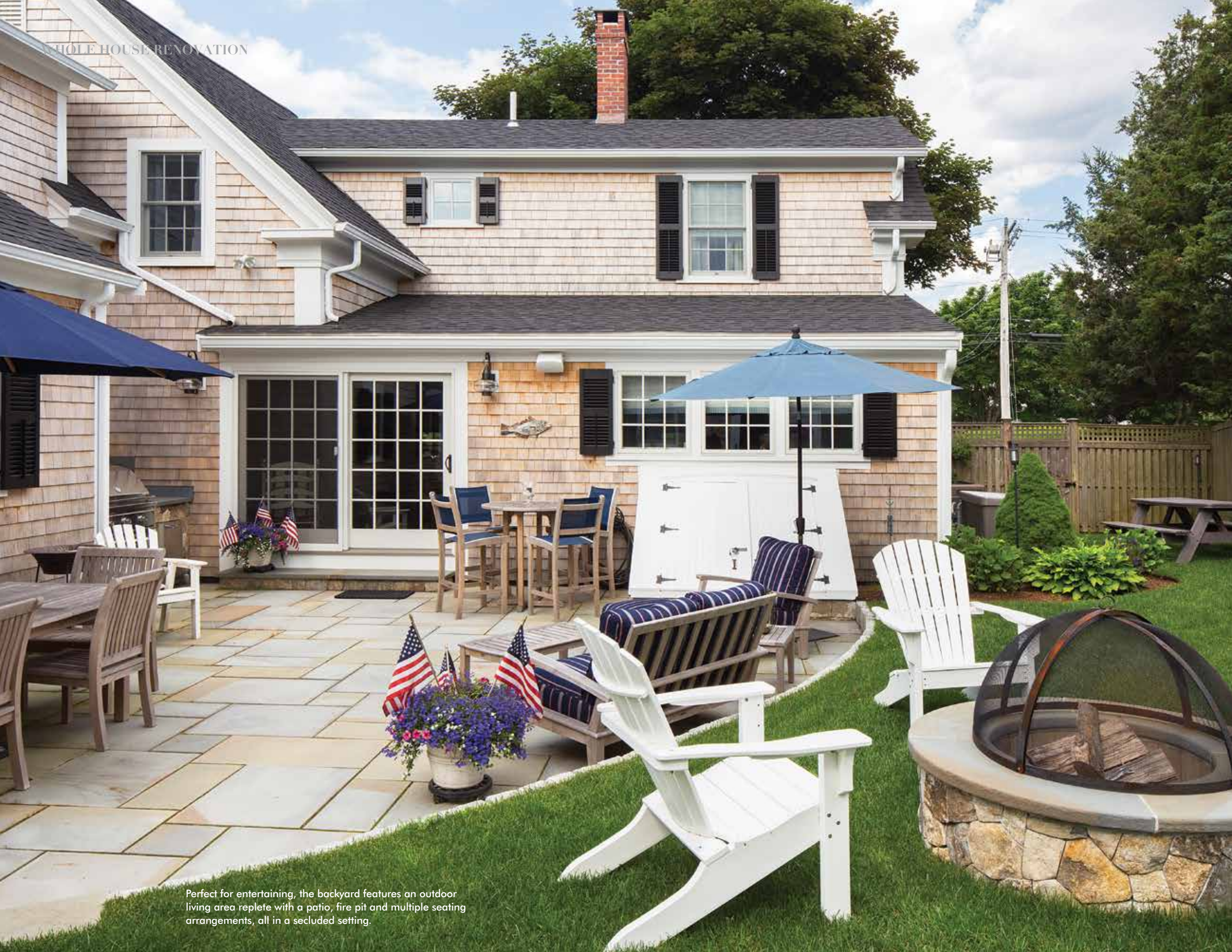
Perfect for entertaining, the backyard features an outdoor living area replete with a patio, fire pit and multiple seating arrangements, all in a secluded setting.