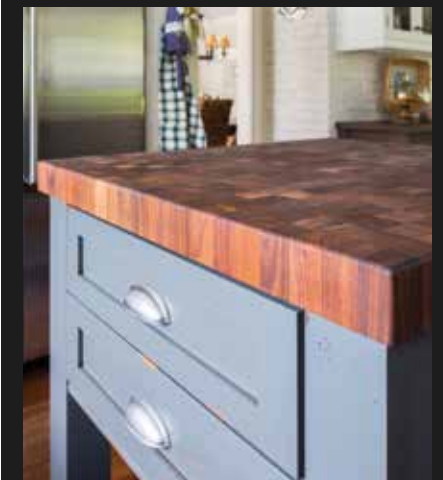
Boos butcher block kitchen island was purchased from Main Street at Botellos.